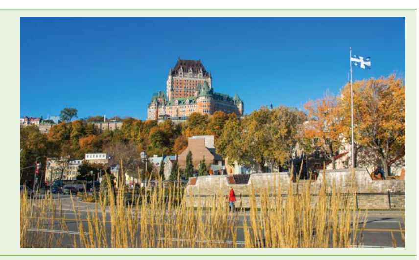
9:45 a.m. to 4:00 p.m.

VIEUX-QUÉBEC AND PARC DE LA CHUTE-MONTMORENCY